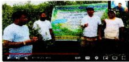
OBSERVATION OF WORLD ENVIRONMENT DAY, STATE LEVEL STUDENT WEBINAR ON "Challenges of Ecosystem Restor"