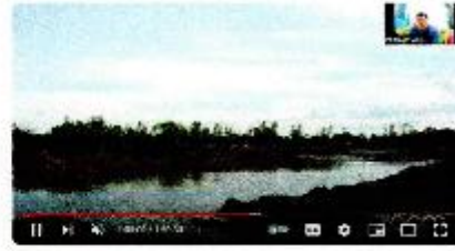
OBSERVATION OF WORLD ENVIRONMENT DAY, STATE LEVEL STUDENT WEBINAR ON "Challenges of Ecosystem Restor"