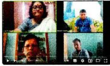
OBSERVATION OF WORLD ENVIRONMENT DAY, STATE LEVEL STUDENT WEBINAR ON "Challenges of Ecosystem Restor"