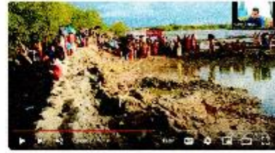
OBSERVATION OF WORLD ENVIRONMENT DAY, STATE LEVEL STUDENT WEBINAR ON "Challenges of Ecosystem Restor"